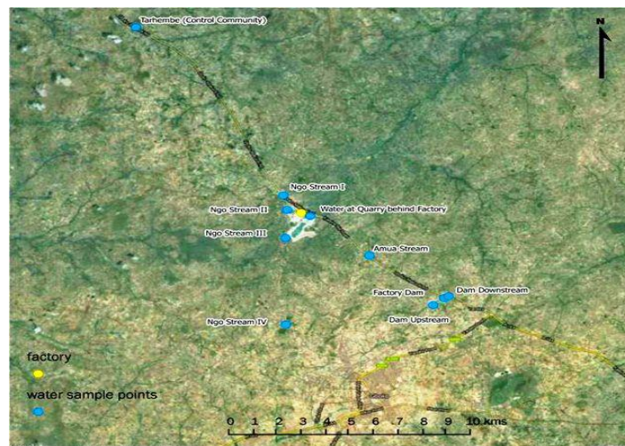
Fig. 2. Water Samples Collection Points