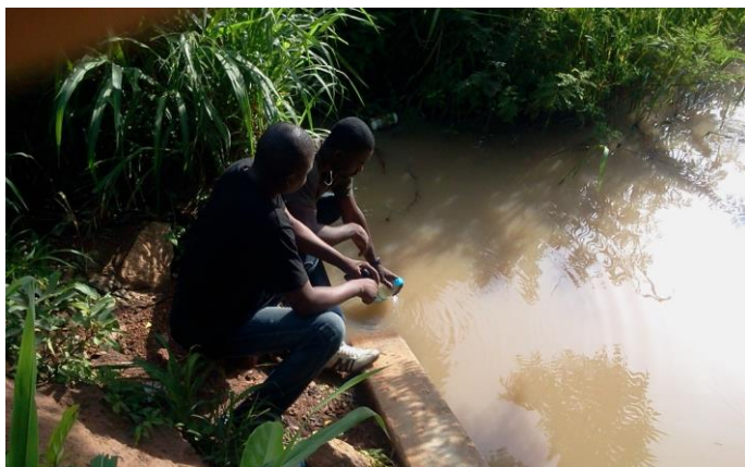
Plate 1. Water samples collection at a stream in study area