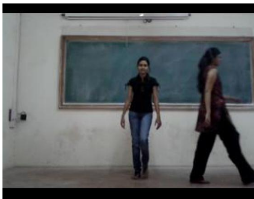
Figure 1: Original Video