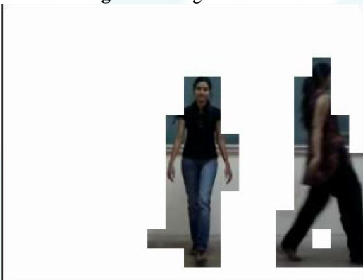
Figure 2: Back ground elimination