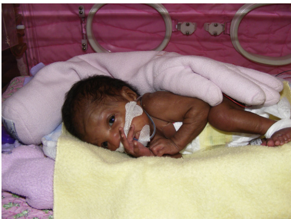
Fig. 3. An example of application of Zaky® side-lying position.

A minimal sample size of 11 infants per group was required with each infant providing six observations for power of 0.87. With a total of 21 comparisons ( \alpha = 0.0024 ), the family comparison alpha rate was 0.05. Accepting an alpha of 0.0024 allowed for a Bonferroni correction.