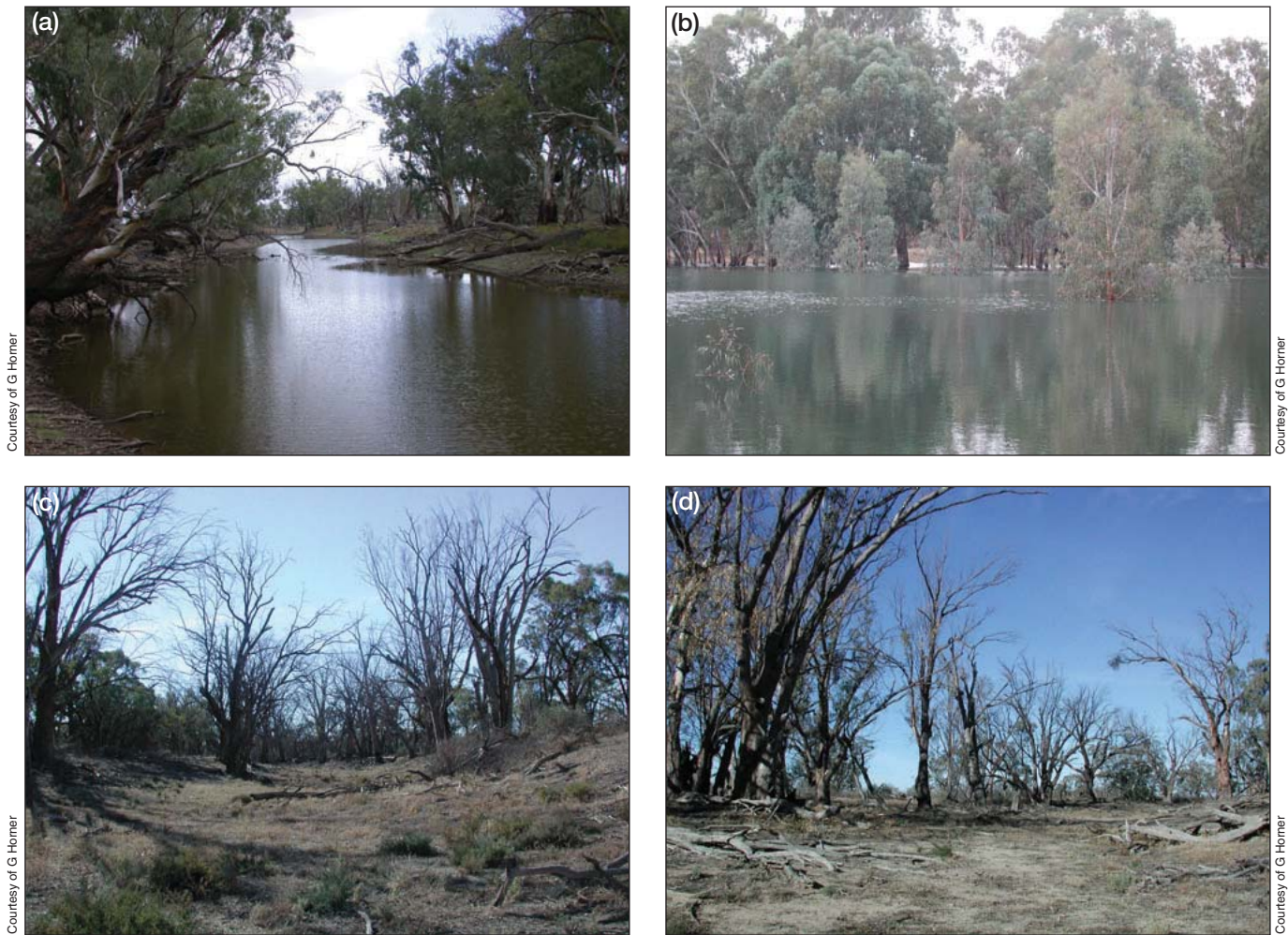
Figure 4. An example of proactive management, in which artificial floodplain inundation is maintaining river red gum ( Eucalyptus camaldulensis ) health on (a) Wallpolla and (b) Lindsay Islands on the Murray River floodplain in southeastern Australia. In neighboring areas of the Islands, (c and d) flow regulation and drought are causing widespread tree mortality. Reactive response will require widespread replanting and the forest will take decades to recover.

with increased discharge, projects involving additional stormwater control or modifications to dams or dam operation may be needed to protect ecosystems and people (Table 2). If these are not implemented proactively, rehabilitation projects to stabilize eroding riverbanks or reconfigure damaged river channels may be required and the costs may be high. In water-stressed areas, efforts involving wetland creation and floodplain reconnection may be needed to increase water retention and groundwater recharge (Figure 4). One could also imagine situations in which drier conditions lead to a need for stream banks to be stabilized or habitats improved (eg if the number of impoundments in the basin increased because of water shortages).