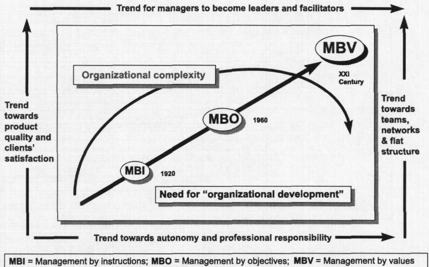
Figure 1. Evolution of three ways of managing companies by instruction, objectives and values

adapt in order to remain competitive in markets that are increasingly more demanding and unpredictable.