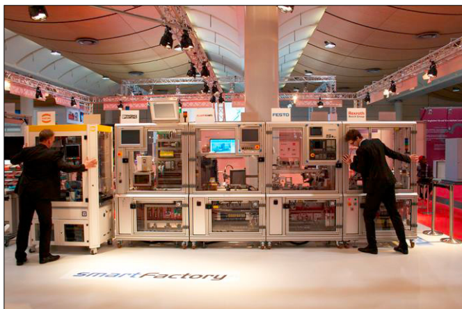
Fig. 3 Plug'n'produce at SmartFactory KL production line

Although solutions according to Lean Automation already exist and research is still ongoing, they are mostly