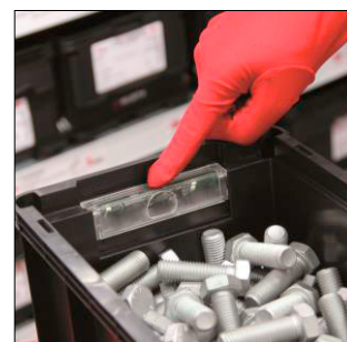
Fig. 1 iBin system installed in a bin

Wittenstein AG and BIBA – Bremer Institut für Produktion und Logistik GmbH work among others in the state-funded project CyProS on a flexible material supply system for production lines. Instead of fixed intervals, an IT system calculates round trip intervals for the transport system based on real-time demands. In the first prototype, collection of data during this so-called milk run is done by scanning QR codes. Interaction with employees of the transport system is