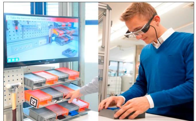
Fig. 2 Augmented reality at SmartFactory KL manual working station

Furthermore, a Smart Product could contain Kanban information to control production processes. An example of a completely de-central controlled production based on Smart Products was demonstrated by SmartFactory KL at Hannover Messe 2014 in Germany. The presented working stations produced autonomously according to a work schedule on the product. Although it was push-controlled production, this concept could be adopted for an order-oriented control system.