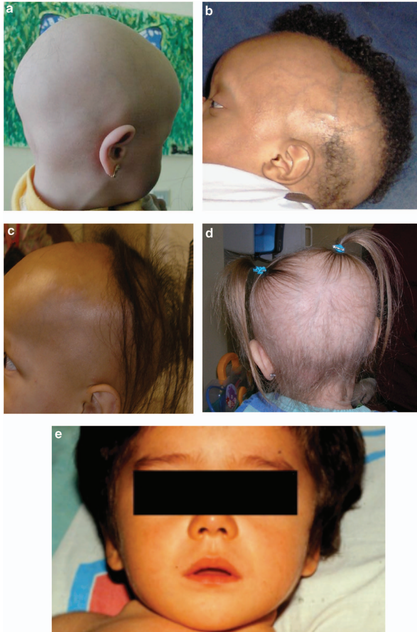
Figure 1 Variations in patterns of scalp hair in children with alopecia. (a) Total alopecia, (b) areas of normal hair adjacent to bald areas, (c and d) different patterns of alopecia despite the children having the same VDR mutation, and (e) child with a full head of hair despite severe hypocalcemia and rickets. Figure from Mol Cell Endocrinol 2011; 347 :90–96 used with permission. 13

mutant VDR along with the WT VDR demonstrated silencing of VDR signaling via the WT VDR. 28 However, in most studied cases, consanguinity is associated with the disease, with each parent contributing a defective gene. Occasionally in non-consanguineous cases, a different mutation has been found on each VDR allele (compound mutations) in the affected children so that the child has no normal VDR allele. 29–31