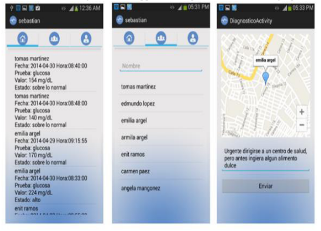
Fig 4. Patient Application Options and Monitoring Option