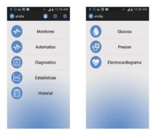
Fig 3. Patient Application Options and Monitoring Option

To validate the efficiency of the system is used in patients with diabetes and heart arrhythmia. For this, a sample of 16 people which used the system for a month, each measuring sensors had diabetes, and EGC, Bluetooth audio devices to broadcast audio guide was made to take readings and workout routines, in addition to containing the smartphone application. In figures. 3 and 4 can be seen interface patient monitoring.