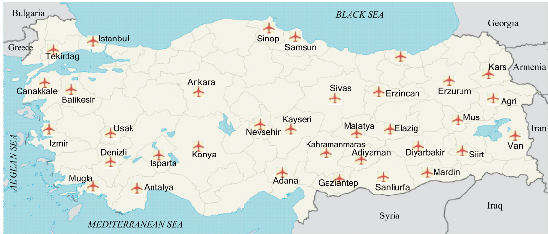
Fig. 2. Airports – potential hubs.