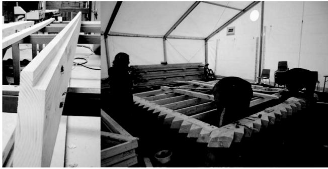
◀ Figure 7. The Camera Obscura project. Left: The cut along the wall planks. Right: Assembly of the sill beams on concrete foundations.

clamping the beam. While the single element was complicated, the total number of different elements was only 8.