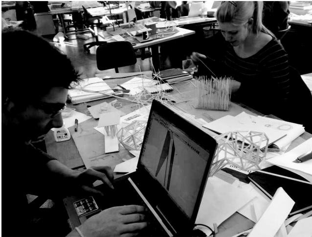
◀ Figure 4. During the concept development phase the students used mostly analogue tools such as sketching and building of physical models, but also simple 3D modeling tools, such as Sketchup.

The use of digital tools in the early phases of the design process has been a topic of discussion for more than a decade. Dokonal and Knight have studied architectural practices to see if the simultaneous use of digital and