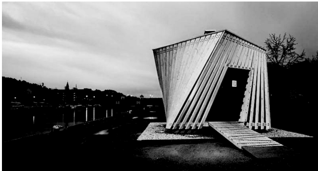
◀ Figure 2. The Trondheim Camera Obscura completed in December 2006.

The two courses had three main purposes. These were to give the students knowledge of and experience in (1) the use of wood as a building