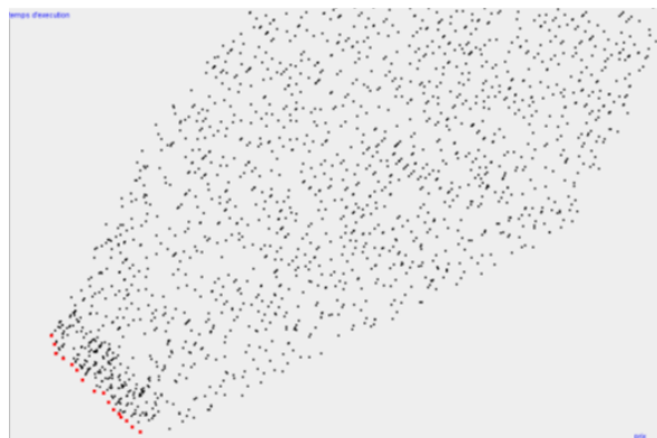
Fig 3. Graphical representation of Skyline web services

Intel (R) Core (TM) i3 M 370 2.40 GHz and 4GB RAM