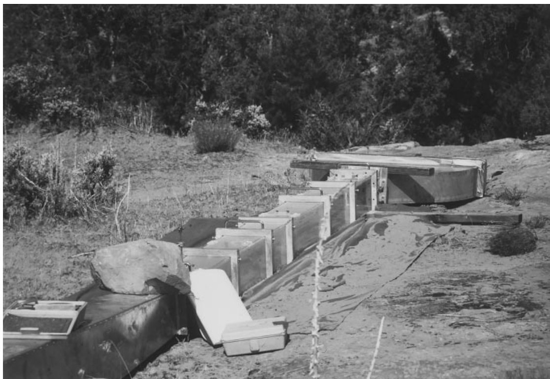
Figure 1. Portable wind tunnel, assembled in the field.

Comparisons across the three crustal classes were done using a two-way ANOVA and multiple range test. T -tests were used to distinguish between disturbance treatments and controls.