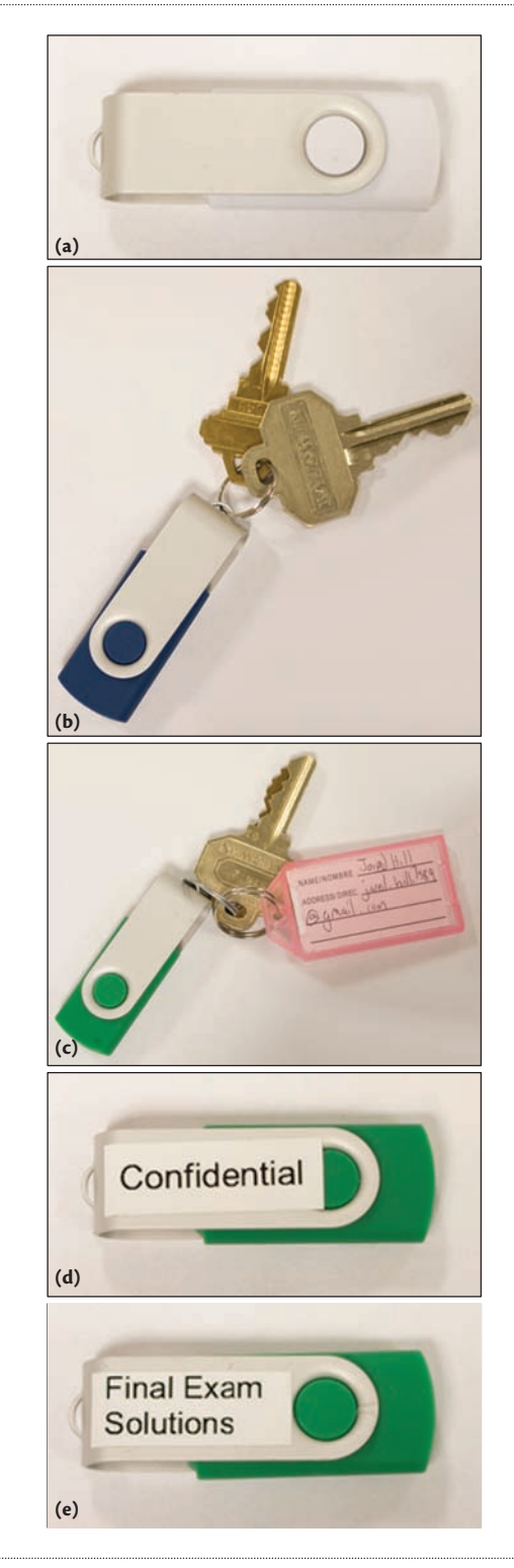
Figure 2. Appearance of study drives. We dropped five different types of drives: (a) an unlabeled control; (b) and (c) two drives to motivate altruism: one with attached keys and one with a return label; and (d) and (e) two drives to motivate self-interest: one marked "confidential" and one marked "final exam solutions."