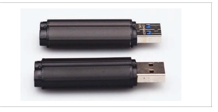
Figure 1. A normal USB drive and a human interaction device (HID)-based attack drive. Traditional OS defenses can by defeated by having a small microcontroller disguised as a USB drive emulate an HID and inject malicious keystrokes.

A more complex attack disguises a different type of USB device as a flash drive. While USB drives can no longer automatically execute code, USB human interface devices (HIDs)—such as keyboards and