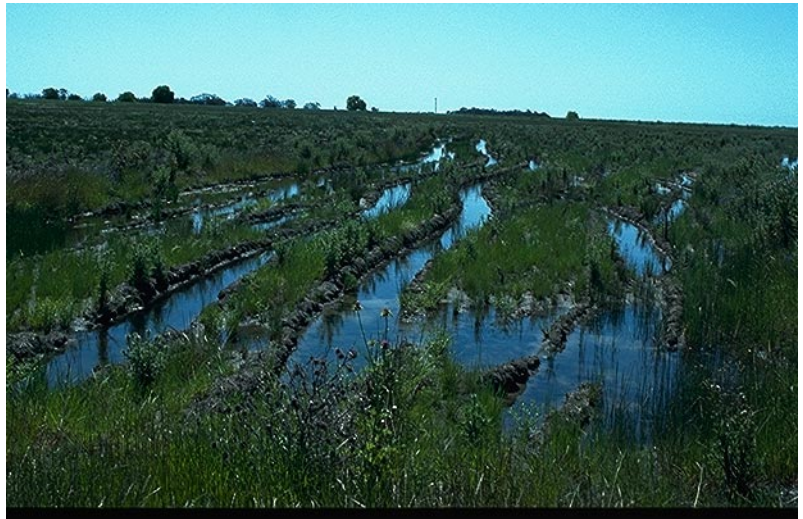
Figures 3 and 4: Poor drainage management wastes water, costing you money and causing seepage through to the watertable.