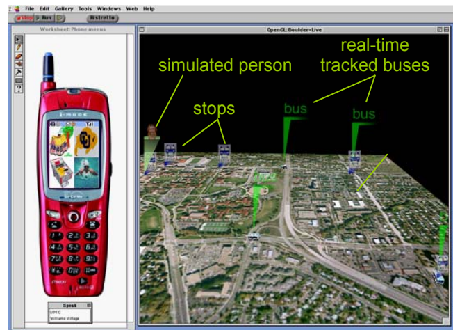
Figure 2: Agent-based prototype showing a mobile prompting device synchronized with a 3D real-time display of the University of Colorado bus system.