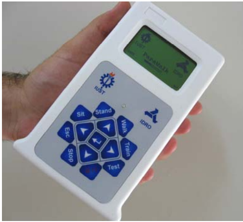
Fig. 1. Parawalk neuromuscular stimulator

both of them. The amplitude of each stimulation channel can be adjusted independently.