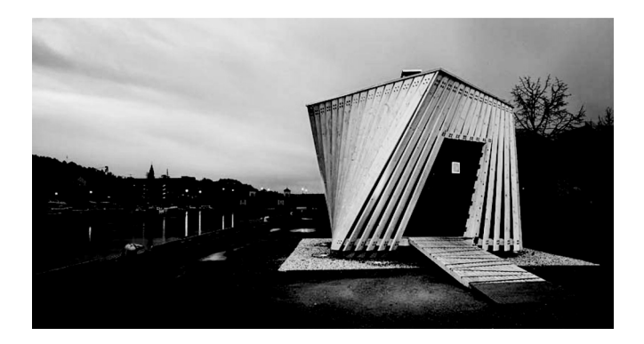
Figure 2. The Trondheim Camera Obscura completed in December 2006.

The two courses had three main purposes. These were to give the students knowledge of and experience in (1) the use of wood as a building