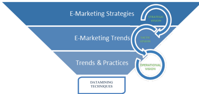
Fig. 1. Business vision and e-marketing

Even so, it is necessary to know the initial state of e-marketing into a sample of the Spanish enterprises dedicated to e-commerce.