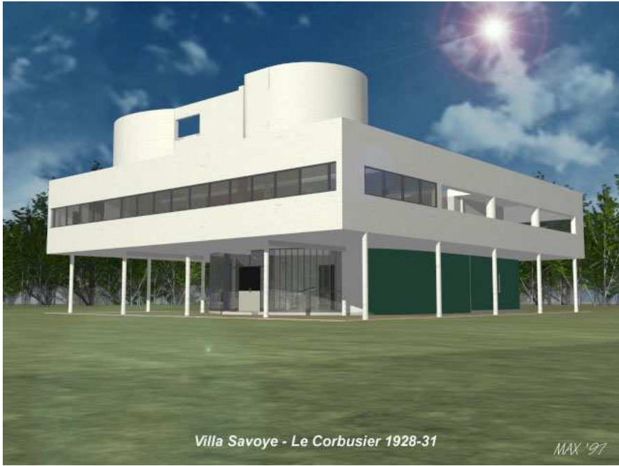
Villa Savoye - Le Corbusier 1928-31