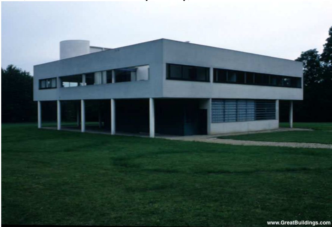
Southeast corner · Villa Savoye · Poissy, France